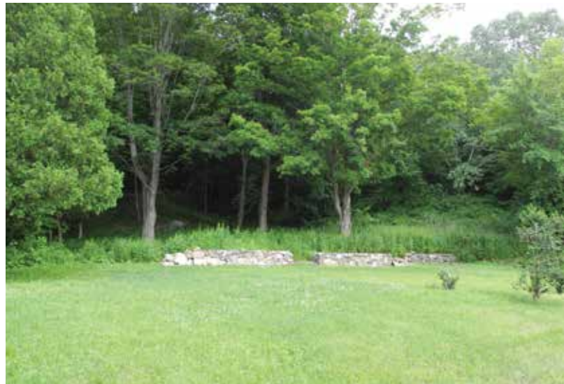
This Parcel Program lot at 19 Maple St. Ext. in Kent is available for lease.